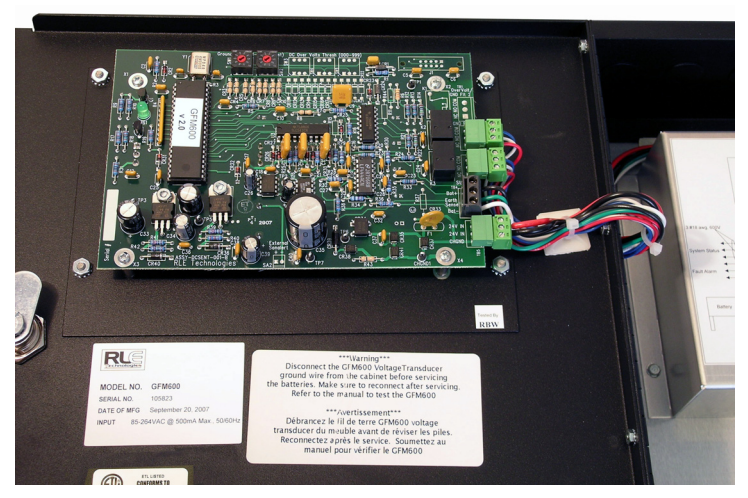
Inside the Front Cover