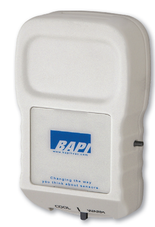
Transmitter with optional Temperature Setpoint & Override

The unit has an estimated battery life of 8 years using two high-capacity 3.6V lithium batteries with a transmit rate of once every 10 seconds. Each transmitter has a unique address with built in error detection. Each variable sent by the transmitter is picked up by the receiver and converted by a BAPI Analog Output Module to a voltage, current or resistance signal for the controller.