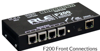
F200 Front Connections