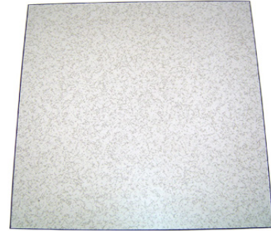
Laminate Topped Panel