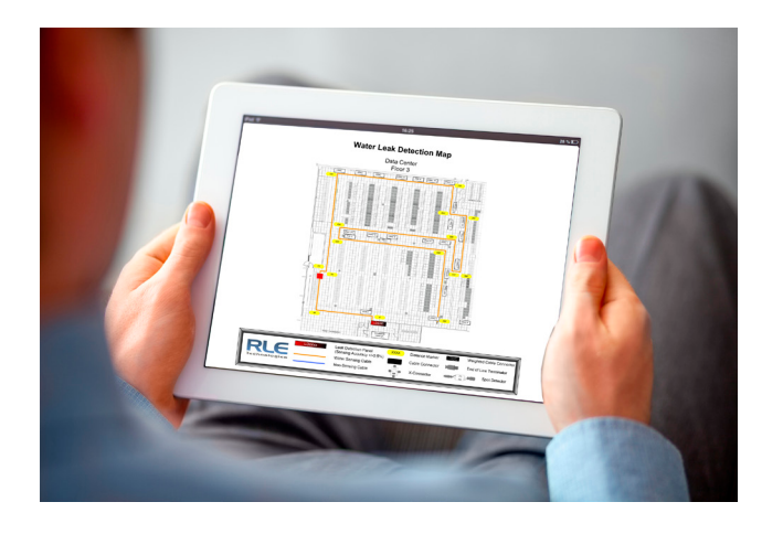
Maps are ready for upload into your leak detection controller's user interface.

Our designers use your drawings to create a custom map of your installation.