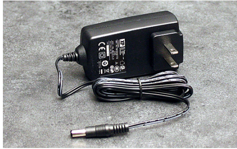
Power Supply PSWA-DC-24