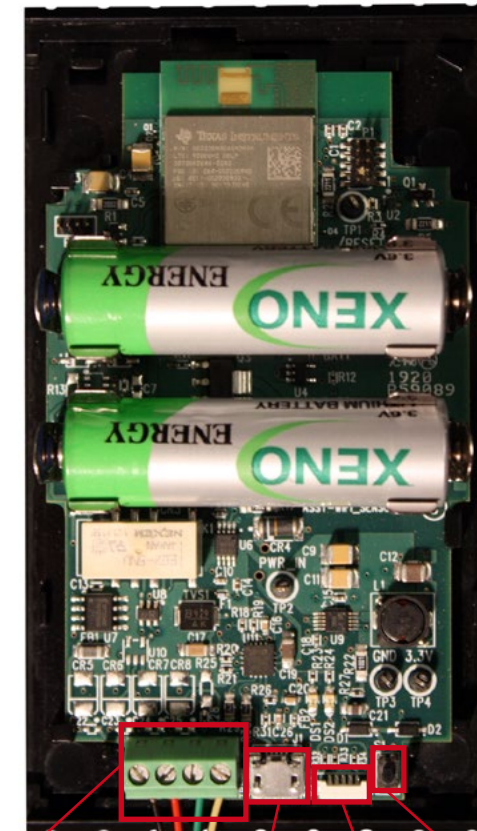
1-Wire Leader Cable Wiring Connection, USB Connection, LED, Push Button