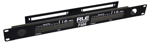
Optional Rack Mount Bracket