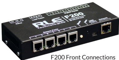
F200 Front Connections