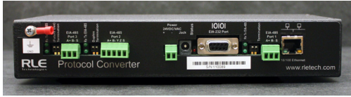
Dual Port Protocol Converter - Three EIA-485 ports

Thank you for purchasing a Protocol Converter. Before you begin to install and configure your device, consult rletech.com to ensure you're working with the most recent version of documentation for that product. The Protocol Converter User Guide is also available at rletech.com. If you need additional assistance, email our support staff - support@rletech.com, or call us at 800.518.1519.