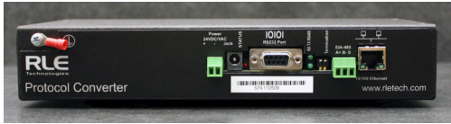
Protocol Converter - Single EIA-485 port