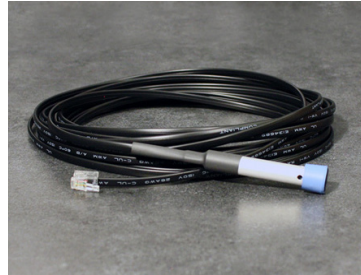
Temp/Humidity Sensor 1WIRE-THS