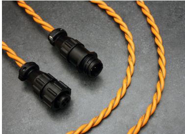
Sensing Cable SC