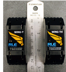
WiNG-T & WiNG-TH